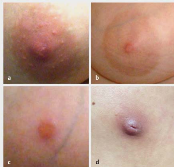
► Fig. 3 Abnormalities of nipple and areola. a Normal nipple of a 39-year-old woman; b Characteristic flat nipple of a 41-year-old patient of Group A with no glands of Montgomery in the areola; c Barely protruded nipple and absent glands of Montgomery in a patient of Group B (27 years old); d Inverted nipple without discernible areola in a 35-year-old patient of Group B.

Disorders of breast development are of great psychological importance during puberty and adolescence. The ensuing limitation on breastfeeding also deserves attention. Among the malformations with increased incidence in women with HED, unilateral or bilateral amastia is certainly the most medically relevant problem, given that it affected 43% of investigated women with non X-chromosomal HED (Group B) in our study. This indicates that mutations of the gene EDAR or EDARADD may result in more serious disturbances of breast development than EDA mutations, which is consistent with published case reports [6–8]. Further molecular