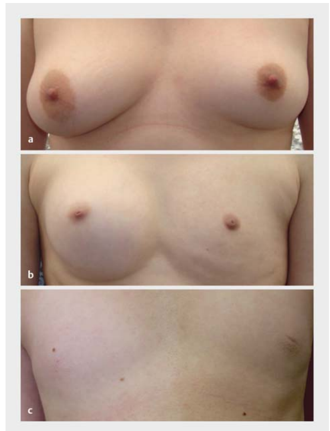
► Fig. 1 Selected images from the photodocumentation of the breast region of female HED patients. a Slight difference in the size of the breasts of one patient in Group A; b Major difference in breast sizes in a patient from the same group; c Complete absence of breasts in a patient from Group B.

58% of the women of Group A and 57% of the women of Group B described their nipples as exceptionally flat. 8% of the women had a nipple malformation which took the form of bilateral inverted (retracted or invaginated) nipples (► Fig. 1 b); the incidence was slightly higher in Group B (► Table 1) and significantly higher than in healthy women, of whom only 1% present with true inverted nipples [17]. The unilateral or bilateral presence of more than